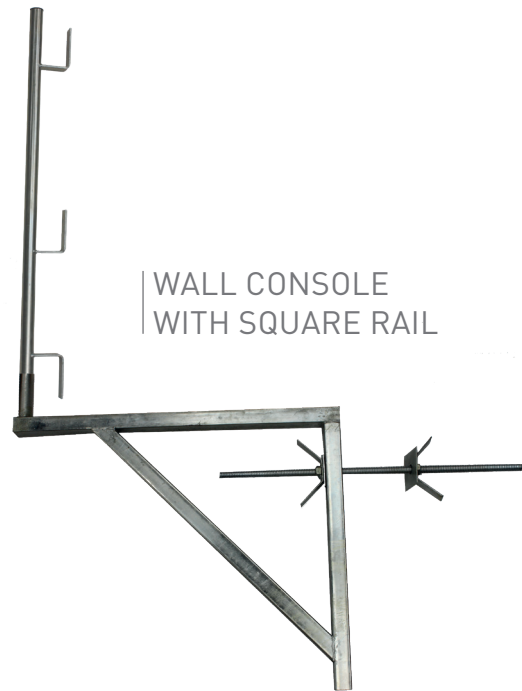
WALL CONSOLE WITH SQUARE RAIL