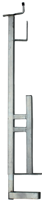
UNIVERSAL FLAG CLIP