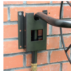
Other fixing position