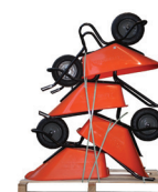
Assembled x 4