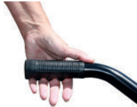
Ergonomic handgrips for a better grip and a better use comfort.